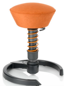
SWOPPER & High- glides