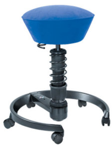
SWOPPER – casters