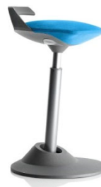
MUV MAN & Tall