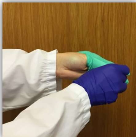
Figure 2: As you pull the glove over your