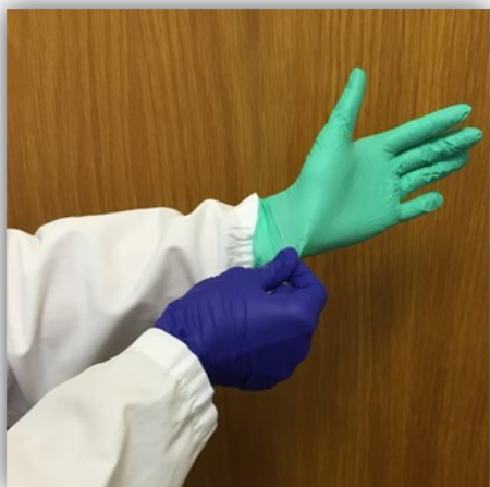
Figure 1: Grip one glove near your wrist.