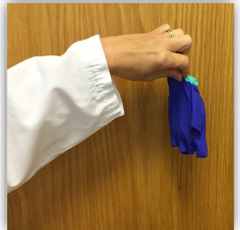
Figure 6: Gripping the inside of the removed second glove, the first glove will be contained inside. Dispose of your used gloves properly.