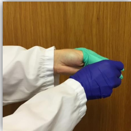
Figure 2: As you pull the glove over your fingers, the glove will be pulled inside-out.