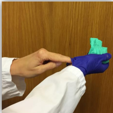
Figure 4: Slide your finger under your second glove, still gripping the first glove.